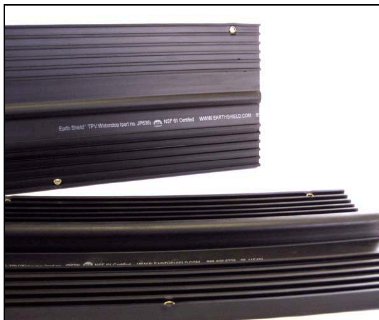
Figure 1 — Factory Installed Brass Eyelets (to facilitate attachment to reinforcing steel)

P.O. Box 1507 Lake Elsinore, CA 92531 T 19516746869 F 19516741315 davidp@earthshield.com http://www.jpspecialties.com